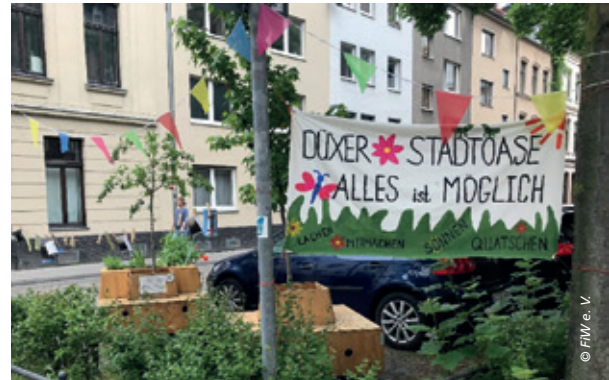
„Greening Month“: Hands-on activities and information events in summer 2021

Imagine a heatwave summer in 2024: the last few weeks have been very dry, the media report that the soil is also very dry and the harvests are declining. You can already see from the window that the city trees are suffering.