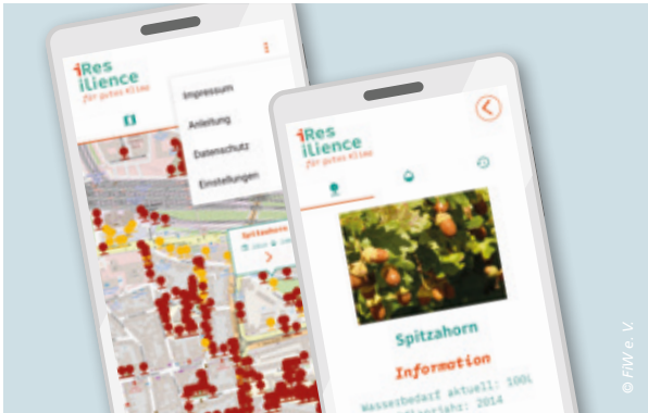
City map with tree selection, information and estimated water requirements

So that not everyone waters the same tree, we have designed a first version of a watering app for Cologne Deutz in the iResilience project. This is a prototype that contains the „basic functions“.