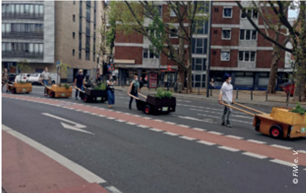
Join in: Planting campaign through the neighborhood